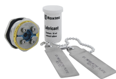
C R S T Ex